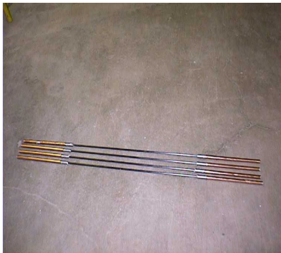
Build Strength GFRP Rod Rebar & Diameter Size